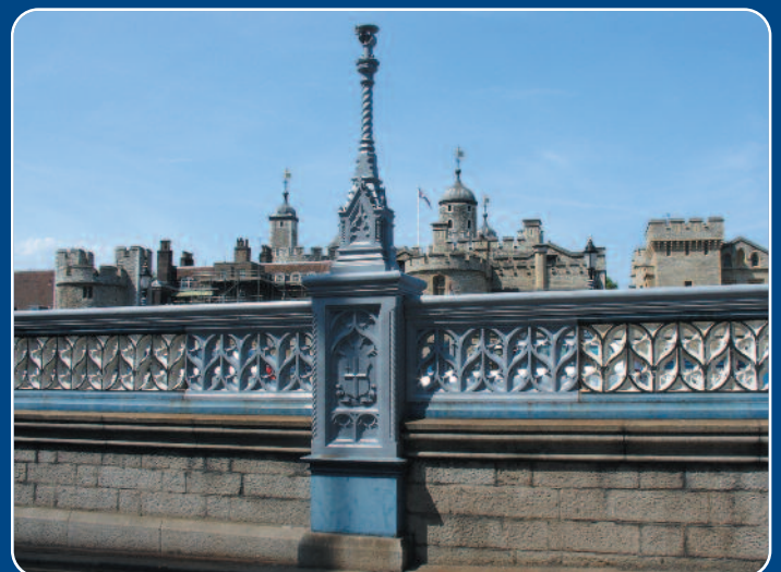
The restored balustrade and lamp stand ready for final painting.

Samson Road, Hermitage Industrial Estate, Coalville, Leicestershire, England LE67 3FP