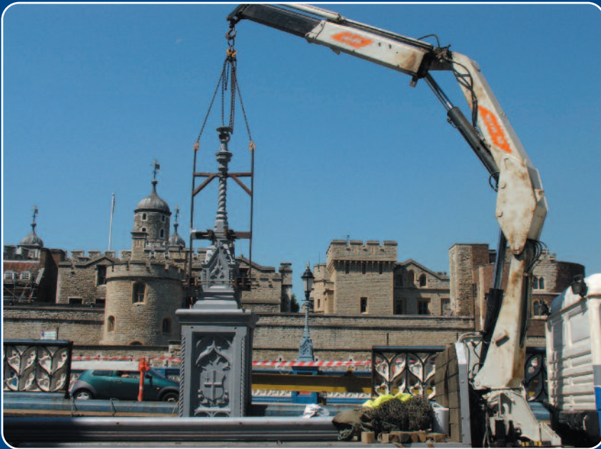
The restored lamp stand was carefully lifted back into place.