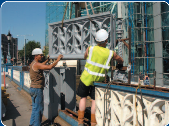
The balustrades are slotted into position followed by the capping rail.